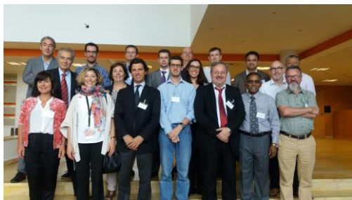
NCEM-5.5 San Sebastian, Spain – Meeting at TECNALIA