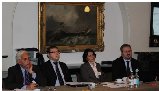
The NCEM-1.1 meeting at Downing College in Cambridge