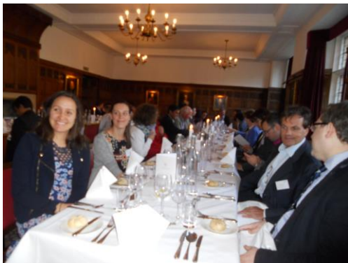
NCEM-5.4 Cambridge – Dinner at St Catharine's College