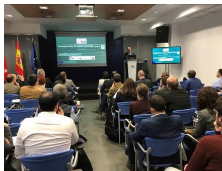
NCEM-5.1 & NanoLeap Open Day - IMDEA Nanociencia, Madrid, Spain

The second meeting of the series 5 ( NCEM-5.2 ) took place in Madrid, Spain on the 20 th January 2017, in conjunction with the NanoLeap Open Day 2017 Workshop (19 th January), which attracted 64 people. Both events were hosted by the IMDEA Nanociencia. This was an opportunity for NCEM members to learn about the NanoLeap Project ( www.nanoleap.eu ), which brings together a European network of pilot production facilities focused on scaling up nanocomposite synthesis and processing methods. The programme was organised in two parts: first part was dedicated to presentations of NANOLEAP pilot plants and Open Access model; second part was focused on interactive open discussion about pilot production opportunities and challenges. The closed meeting for the NCEM Members took place the following day, where NCEM members were welcomed by Prof. Rodolfo Miranda, Director IMDEA-Nanoscience.