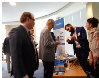
NCEM-5.4 Cambridge- UltraWire 2017 Exhibition Stands