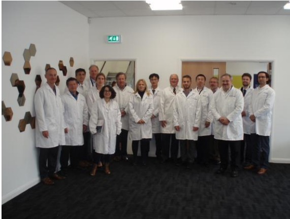
Visit of the Cambridge Nanosystems laboratories during NCEM-3.5 Cambridge meeting