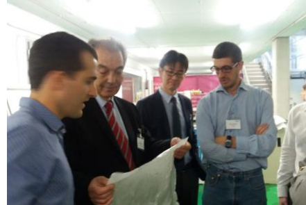
NCEM-5.5 San Sebastian – Visit to TECNALIA's labs