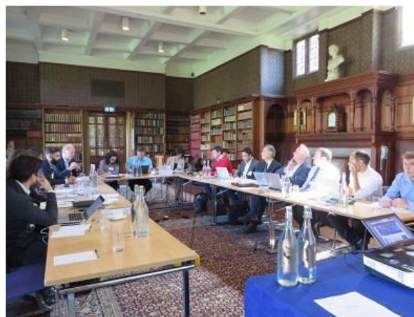
NCEM-4.4 meeting at Girton College in Cambridge

The fourth meeting of the NCEM-4 ( NCEM-4.4 ) was in Cambridge , UK was linked with the Centre for Business Innovation (CfBI) Summer Summit & Dinner. This was an opportunity to meet with