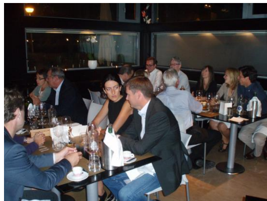
Consortium dinner at the NCEM-2.2 meeting in San Sebastian organised by Graphenea